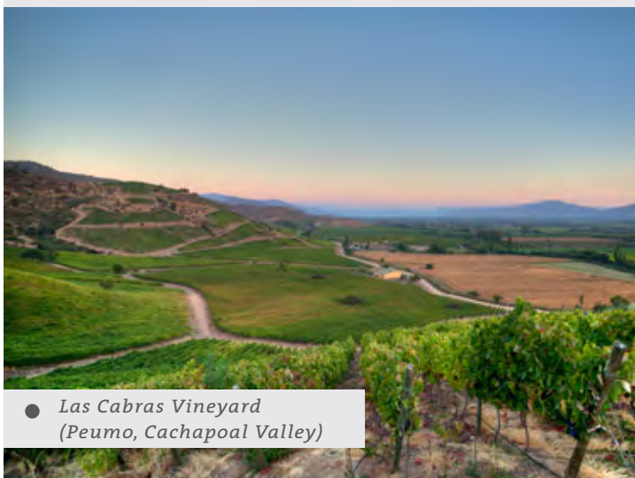
● Las Cabras Vineyard (Peumo, Cachapoal Valley)