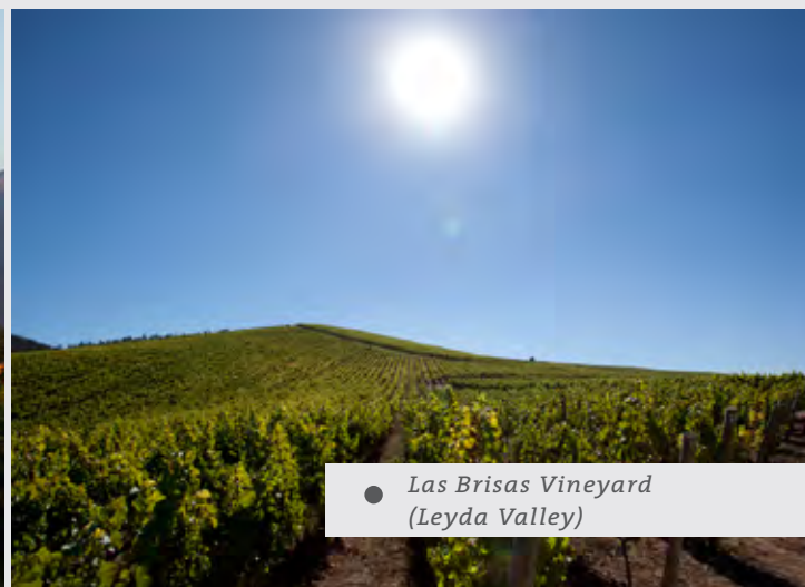
● Las Brisas Vineyard (Leyda Valley)