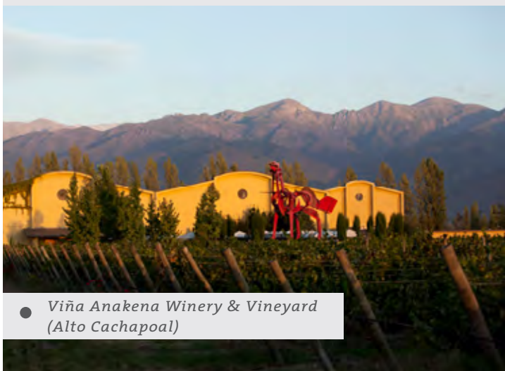
● Viña Anakena Winery & Vineyard (Alto Cachapoal)

Anakena unveils its origins: The source of our high quality wines. Four vineyards located in Chile's best terroirs, from where we craft our premium fine wines.